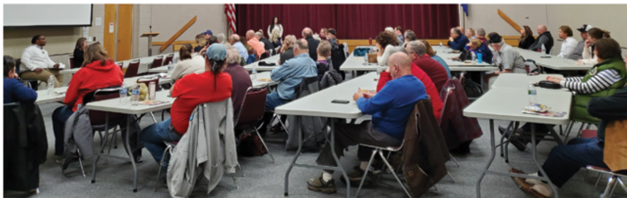
Community members engage with the panel of experts following a showing at the Kenosha County Center